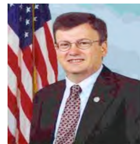
Rep. Mark Souder Republican - Indiana Gov. Reform Committee