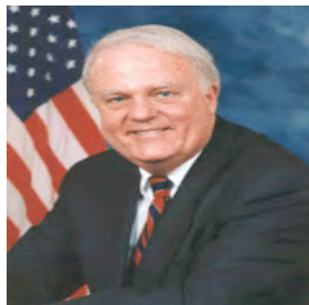
Rep. James Sensenbrenner Republican - Wisconsin House Judiciary Committee