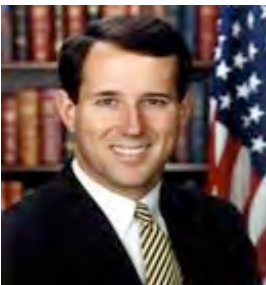
Senator Rick Santorum Republican - Pennsylvania Senate Finance Committee